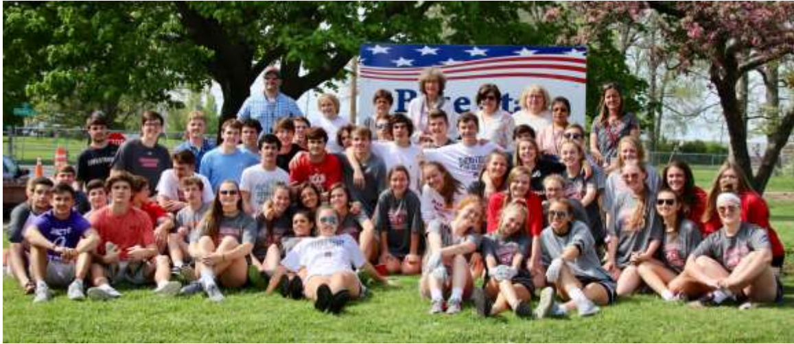
LAX players and parents make dinner for Vets and Canteen on 5/16/18. Canandaigua Memorial Day parade getting ready for SFS!